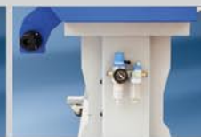
High quality air cylinder