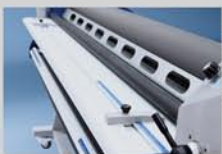
Thick feeding tray with squaring guide and paper guide ensures precise application