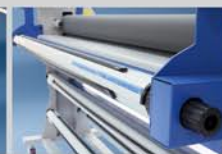
Once laminated, the prints can wound onto the take-up roll