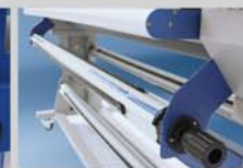
Once laminated, the prints can wound onto the take-up roll