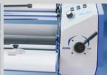
Fully adjustable height and pressure by air valve